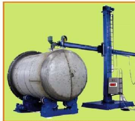
COLUMN & BOOM MANIPULATOR FOR BOILER WELDING