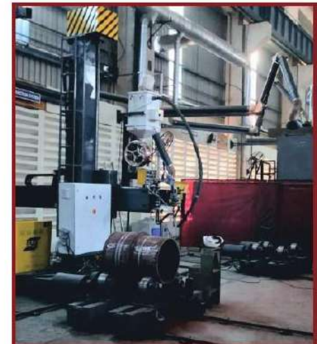
C & B WITH SELF CENTERING ROTATOR