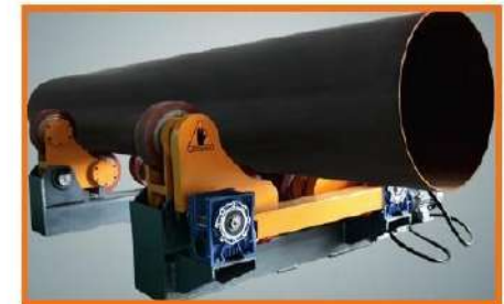
SELF ALIGNING ROTATOR