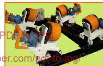
SPHERICAL VESSEL ROTATOR