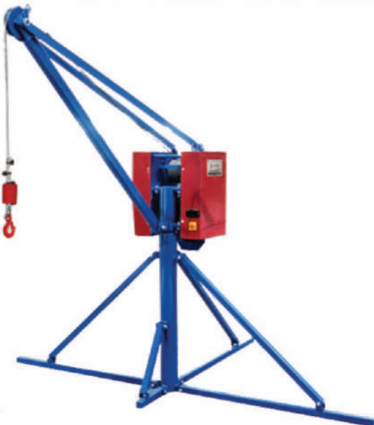
FULLY LOADED 300 KG MINI LIFT