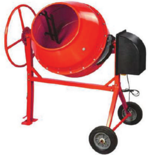
200 Litres Mixer Machine Power 0.5 HP Power, 240 V / 50 Hz