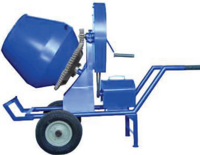
3.5 Cu.Ft Hand / Electric Mixer 1 HP Electric Motor