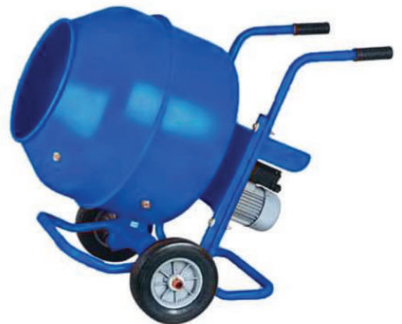
230 Litres Mixer Machine Power 1.5 HP Power, 240 V / 50 Hz