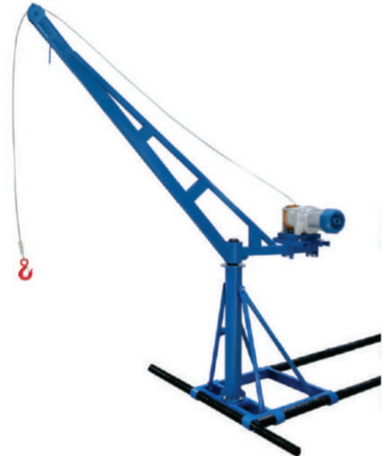
300 KG CONSTRUCTION MINI LIFT