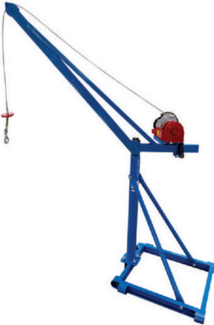
200 KG MINI LIFT

No: 2/595, Kumaran Street, Balaiah Garden, Madipakkam, Chennai – 600 091. Mobile: +91 98409 42706 / +91 78239 40099 Email: epsindieengineers@gmail.com Email: prkindieengineers@gmail.com