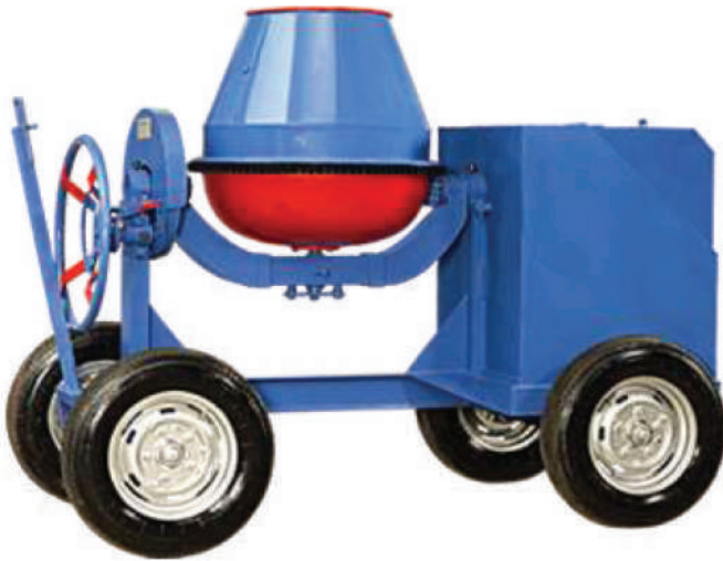
5/3 Cu.Ft (140/100 Litres) 1/2 bag Mixer Machine

No: 2/595, Kumaran Street, Balaiah Garden, Madipakkam, Chennai – 600 091. Mobile: +91 98409 42706 / +91 78239 40099 Email: epsindieengineers@gmail.com Email: prkindieengineers@gmail.com