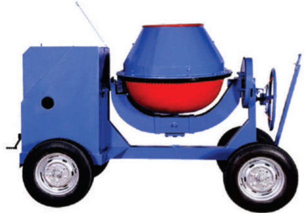
10/7 Cu.Ft (280/200 Litres) Without Hopper Mixer Machine