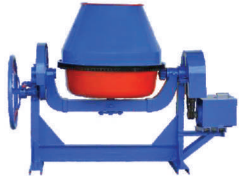
7/5 Cu.Ft (200/140 Litres) Bed Type Mixer Machine