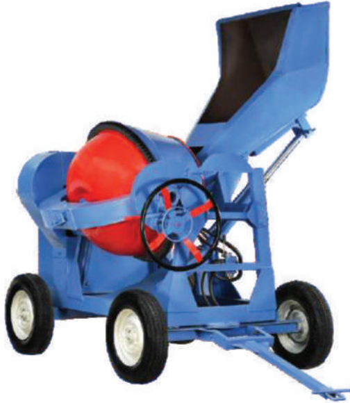
10/7 Cu.Ft (280/200 Litres) Hydraulic Hopper Mixer Machine

No: 2/595, Kumaran Street, Balaiah Garden, Madipakkam, Chennai – 600 091. Mobile: +91 98409 42706 / +91 78239 40099 Email: epsindieengineers@gmail.com Email: prkindieengineers@gmail.com