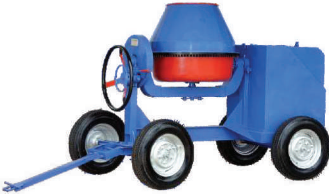
7/5 Cu.Ft (200/140 Litres) 3/4 bag Mixer Machine